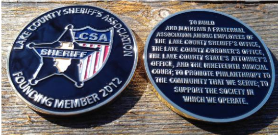
Founding Members Challenge Coin

With your annual dues, all members received at no additional fee, an annual proof-of-membership challenge coin, and two vehicle window decals.