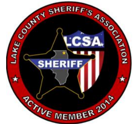
2014 Members Vehicle Decal

If you are eligible, you may complete the enclosed application and return it to the Lake County Sheriff's Association in person or via US Mail using the information on the back.